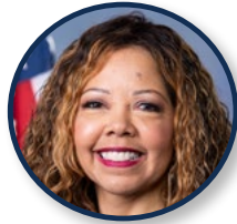
Lucy McBath District 6 63.80%